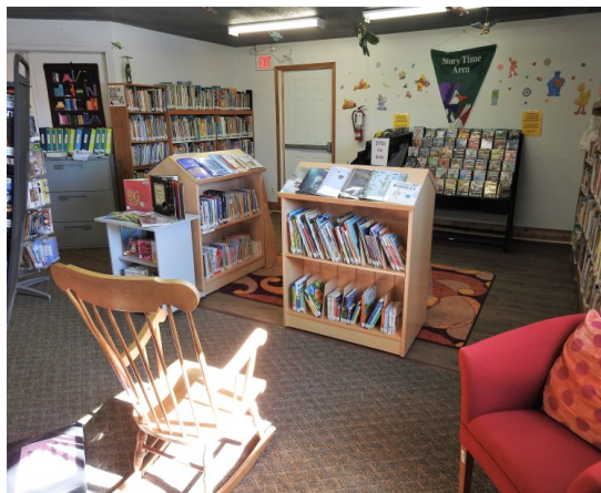
In March, much-needed new flooring was installed in the Children's section...