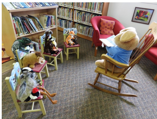
...but only the Library's resident teddy bears could enjoy it during lockdown! We were very happy to welcome back patrons in July.