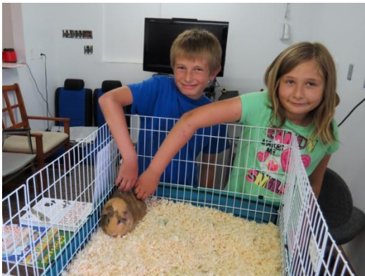
Caramel the Guinea Pig visits the Library!