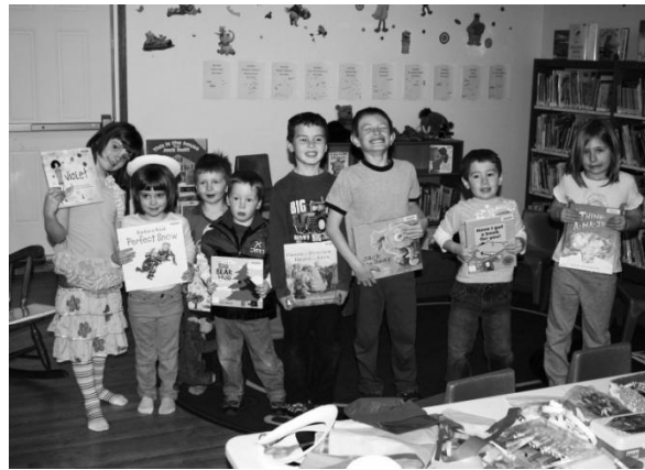
Young readers vote for their favorite story in the Blue Spruce reading program, April 2.